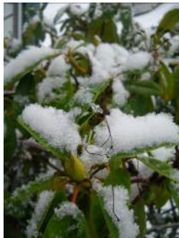
Snow-covered rhododendrons

It's crunch time for the 2011 Master Gardener Program. Cori and I have been working hard to find any future Master Gardeners out there, so I've had little time to do much else. Thanks to some collaboration with Nancy Mills, you now have the option to subscribe to the Master Gardener Program blog. To subscribe, go to the blog website ( wsumgtc.wordpress.com ) and you'll see a box where you can enter your email address. If you enter your email address and you'll receive an email when the blog has been updated. In other news, you can now view and share all the pictures at I have been taking at Master Gardener events via Google's Picasa software. Just go to http://picasaweb.google.com/thurstonmastergardeners to view the photographs. You can share photos here too! To upload photos, simply go to http://picasaweb.google.com , enter the username "thurstonmastergardeners" and the password "garden123." I look forward to beginning my Master Gardener training soon. I'm sure I'll see many of you out in the demonstration gardens! Until then, enjoy the rest of winter, and happy gardening! :)