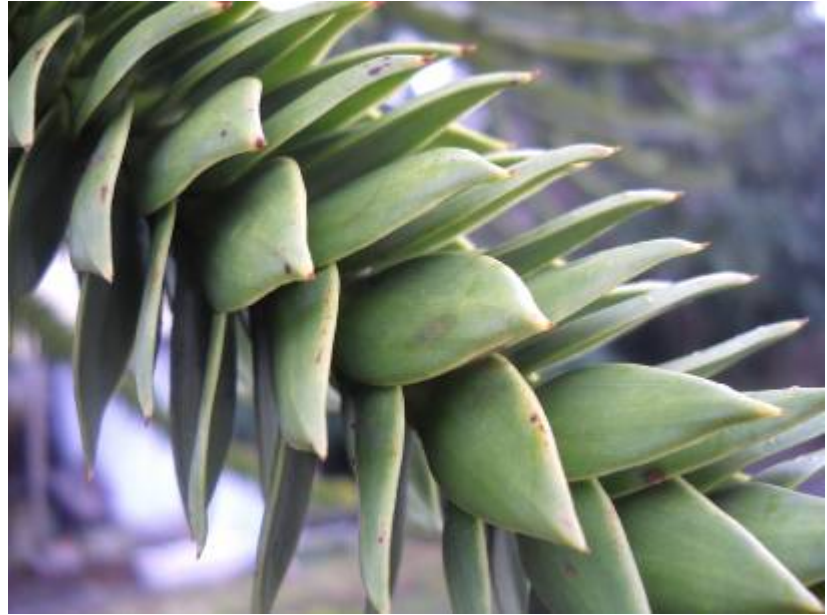
The monkey puzzle tree on State Ave near Eastside St, Olympia!